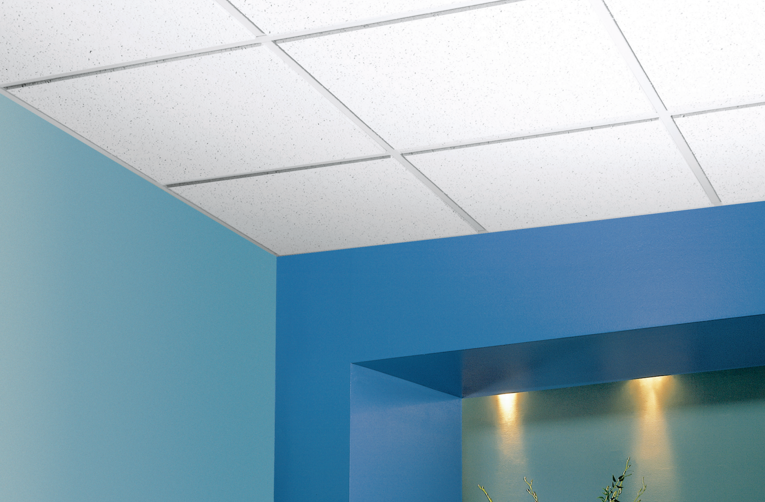
Baroque™ Reveal (BET-154)